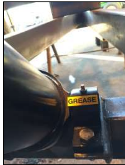
Hydraulic ram saddle