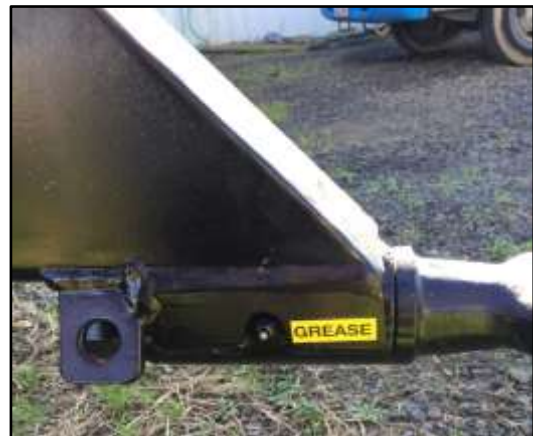
Swivel Tow Eye Grease nipple

To Grease Jack, use a 10mm Spanner to remove nyloc nut and bolt. Remove cap and grease gears inside.